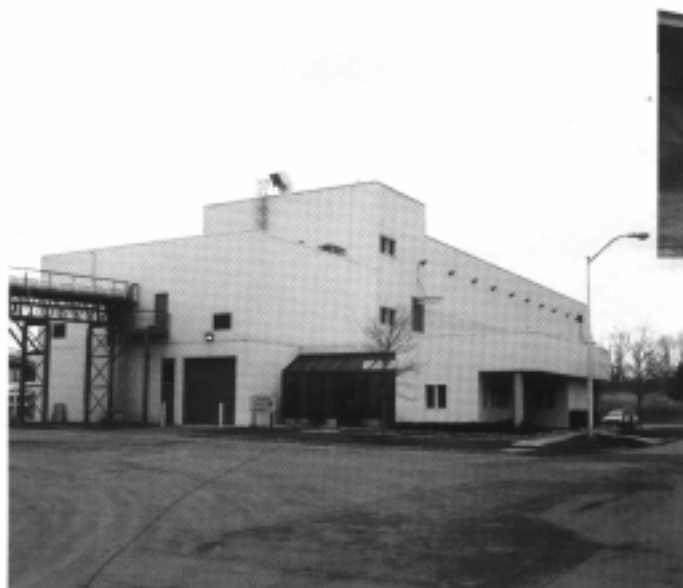
AirLance Compost System Schenectady, New York